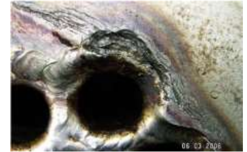
Figure 2: Crevice corrosion in seawater cooler (Wraglen p.179)

In naval environment stainless steel will never corrode uniformly. Corrosion is localized, i.e. crevice corrosion. Localized corrosion often is being promoted by a biofilm. Crevice corrosion is a major problem in naval environment because of the low resistivity of the water (seawater resistivity is about 0.35 Ohm•m). Even 6% Mo SS at 30°C can suffer crevice corrosion in seawater.