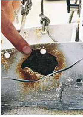
Figure 3. A large rust patch was started by water getting under the protective paint work at the edge of the hole and has resulted in substantial damage.

environment, for example, oxygen from the surrounding seawater. Some metals use the oxidation process to protect themselves, while the process destroys other metals. Rusting is the common name for the metallic flaking of steel and iron, however it is still oxidation.