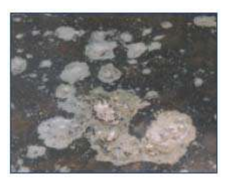
Figure 6. Pitting Corrosion

Pitting frequently occurs in metals that use an oxide layer to protect themselves. Metals such as stainless steel tend to pit in seawater if the mechanism that maintains the film breaks down for any reason. The hindering of the self-repairing film is usually the result of changes in the environment over the surface of the metal. Some examples include: differences in temperature, variations in the oxygen supply over the surface, or an uneven flow of water over the surface of the metal component.