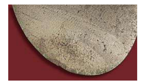
Figure 4. The pitted area closed to the blade tip is caused by cavitation